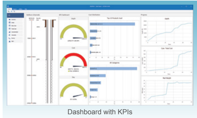
Dashboard with KPIs